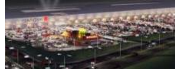
Croatia, Supernova, Zadar