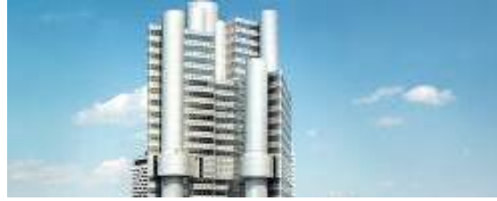
HVB Tower Arabellapark, Munich