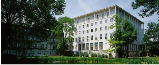
Allianz Headquarters Schwabing and BGU Unterföhring (Munich)