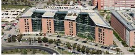
Hungary „D“ Building IVG, Budapest