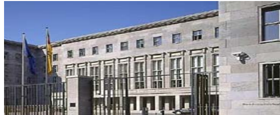
4 German Government Departments with 17 buildings in Berlin