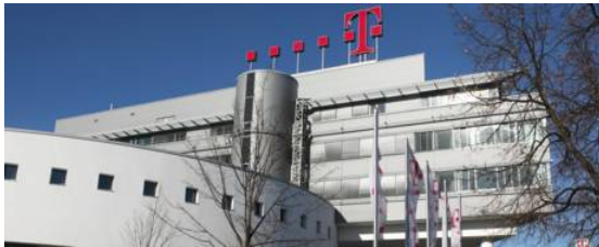
Deutsche Telekom AG Sample of 250 properties across Germany