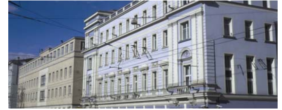
Russia, Business Center Forum 2, Moscow