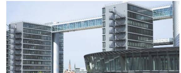
Ten Towers, Munich