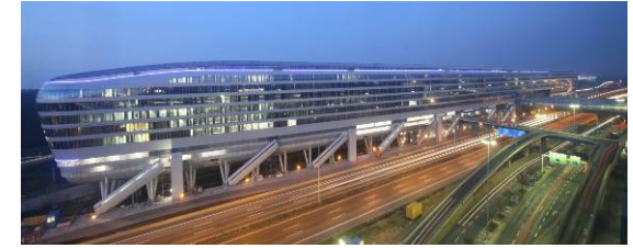
The Squire, Frankfurt