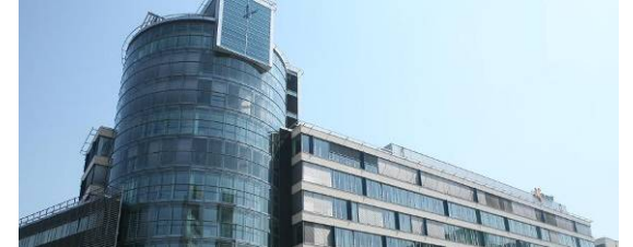
Czech Republic, Union Investment Trianon, Prague