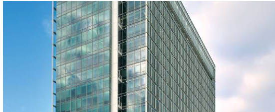
Czech Republic, City Tower, Prague