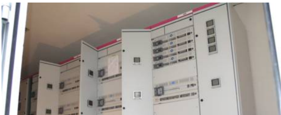
30 data processing centres in Germany