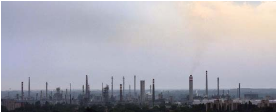
Slovakia, SlovNaft, (Petrochemical refinery), Bratislava