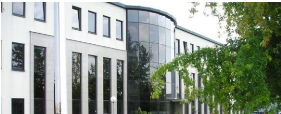
Austria, Schneider Electric, Vienna