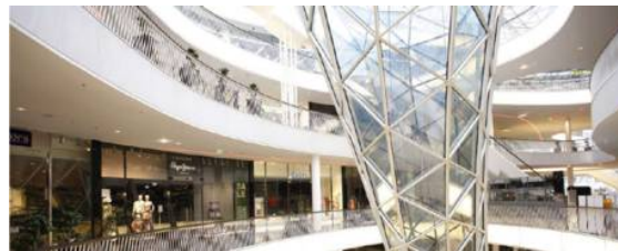
PalaisQuartier with shopping centre MyZeil, Frankfurt