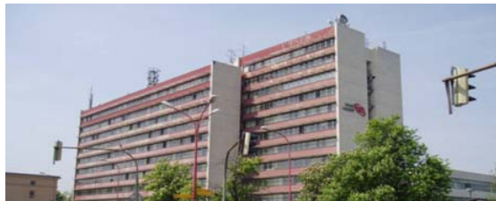
Slovakia, building at Jarošova street, Bratislava